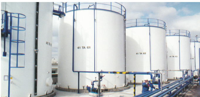
Yara's liquid fertiliser production - Elvington

For further details please contact your local Yara Area Manager or visit www.tankmix.com