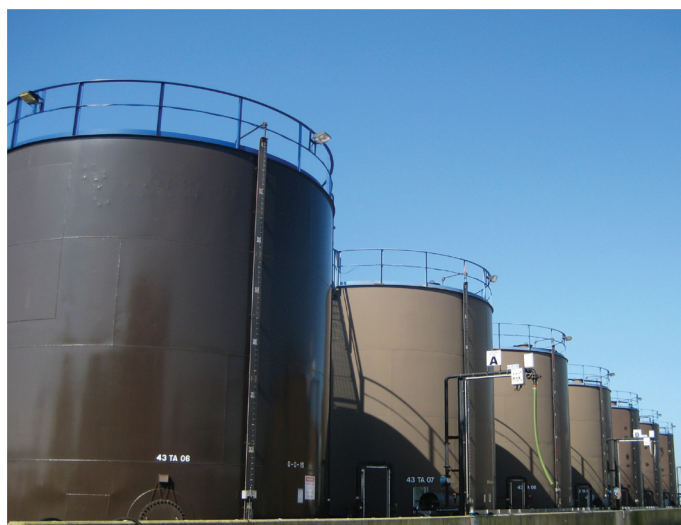
Yara's liquid fertiliser production - Chedburgh