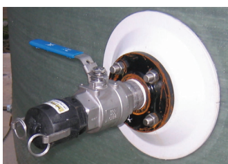
Lockable stainless steel valves